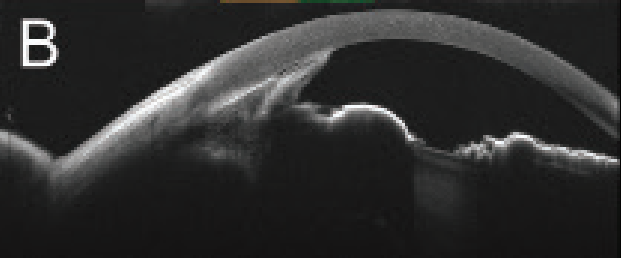
Figure 2. Eleven months later (July 2020) a subtotal regression of the cyst was observed both at the slit lamp ( A ) and with the anterior segment optical coherence tomography ( B )

[1]. However, it seems that the majority of these primary lesions are stationary, and show very little growth over time, particularly in adults [1]. Therefore, conservative management should be considered.