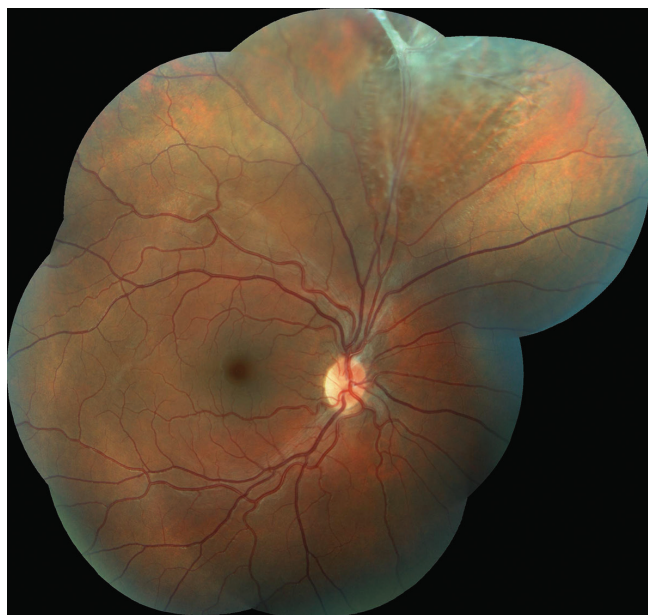
Fig. 1 Colour photographic image of the fundus of the right eye: the retina is thinned in the upper quadrants, in the upper temporal arcade there are residues of persistent hyaloid artery with fibrotic tissue, causing local retinoschisis of an older date.

method was within the norm, in the right eye 17 torr and in the left eye 13 torr. Visual acuity (VA) evaluated with the aid of Snellen's optotypes was as follows: uncorrected visual acuity (UVA) in right eye 0.4, with correction -0.5cyl on an axis of 40° 0.8, in left eye UVA 0.8, not improved by correction. Upon examination on a slit lamp, the finding on the anterior segment was bilaterally physiological.