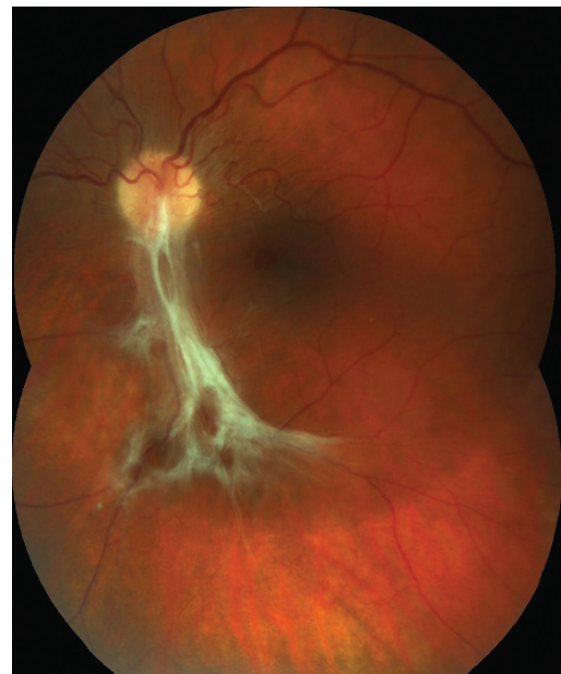
Fig. 5 Colour photographic image of fundus of left eye: preretinal fibrosis in lower temporal arcade causing draping of retina in central landscape

posterior capsule of the lens (fig. 3), also physiological finding on the RE as well as LE. Fundoscopy in mydriasis of the RE demonstrated a proximal part of the PHA adhering to the upper temporal arcade, where it conditioned the origin of local TRD of an older date (fig. 4), in the surrounding area there were