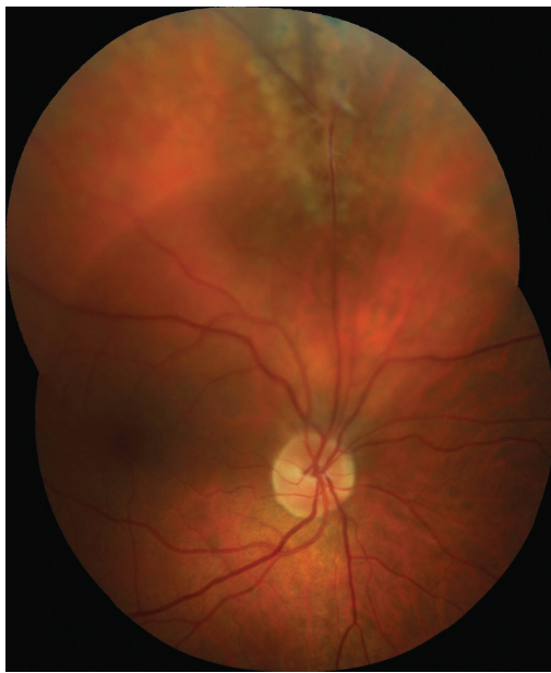
Fig. 4 Colour photographic image of fundus of right eye: proximal segment of persistent hyaloid artery binding to upper temporal arcade, with local tractional retinal detachment of an older date