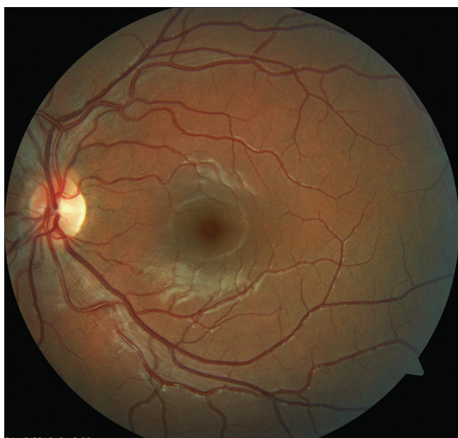
Fig. 2 Colour photographic image of fundus of left eye: physiological finding on ocular fundus

Examination of the anterior segment on a slit lamp revealed PHA of the RE with an attachment of the distal segment to the